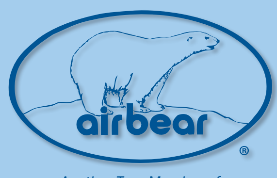
Another True Member of the Air Bear® Family