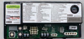
Intelligent Hydronic Control

There are a few reasons why over TWO MILLION Burnham Series 2 boilers have been installed in American homes. Performance, reliability, safety, and overall efficiency have a lot to do with it. The Series 2 is designed to work with an existing chimney, and is available in many sizes to fit the needs of virtually any application. With the Intelligent Hydronic Control, a new full feature control system, and improved operating efficiencies, U.S. Boiler Company is providing even more good reasons why the Series 2 will remain at the top of the list for years to come.