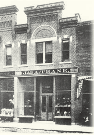
Trane Storefront La Crosse, Wisconsin 1891

Trane has a tradition of quality lasting more than a century.